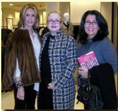
This weeks social light photos...

The best family party of any year got bigger and better this year when The Parade Company moved it to Ford Field and changed the date from Thanksgiving Eve to the Saturday before Thanksgiving. Although the new date may have precluded attendance by some who previously came from afar to be with family for Thanksgiving, it obviously inspired others to attend as the numbers were up from 1,600 last year to 1,800.